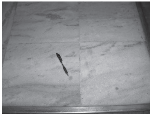
Figure 1 – An example of pathology

During the process of design development, may occur leaves the designer to observe some basic requirements such as: parameters for the functioning and overall quality of the work, the interactions between different parts of the building, and constructibility. Thus, it is often the emergence of so-called congenital diseases, i.e. diseases constructive generated even at the design stage, as disobedience to the rules of drawing up buildings designs (NBR 13531/95 and 13532/95), generally resulting in the emergence from disease. In this sense [2] presented statistics showing that in European countries, over 40% of all diseases presented in constructions originate in deficiencies related to the projects of buildings. An example could be seen in Figure 1.